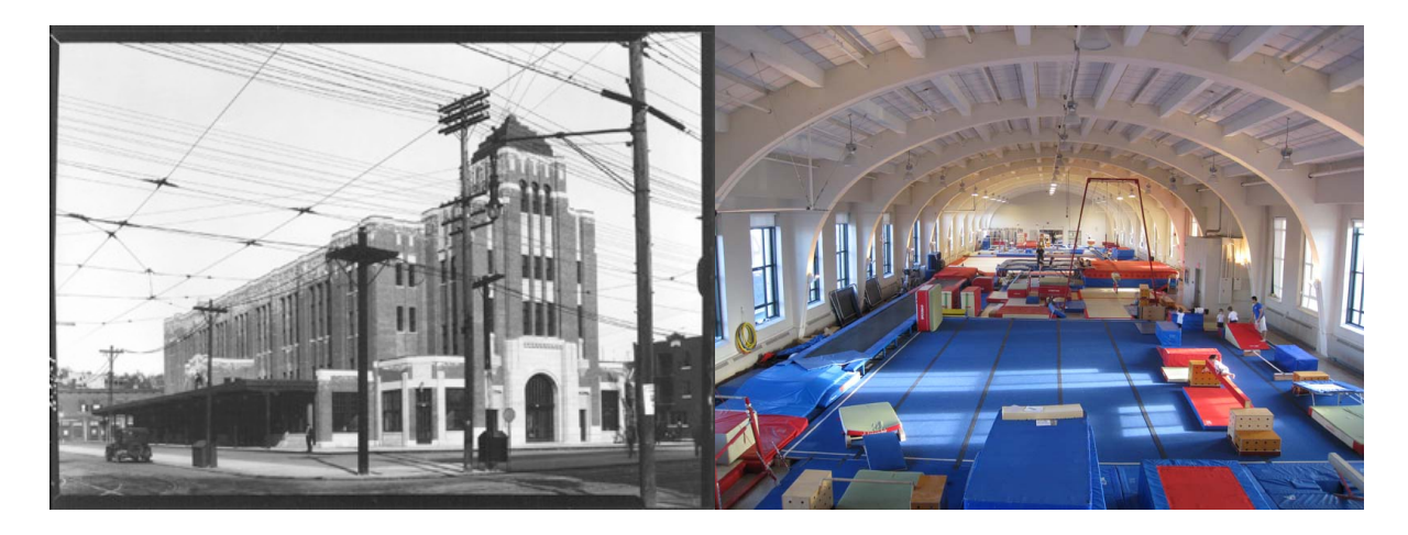
Fig. 5 St. Jacques Market , 1933. Trudel and Karch Collection. Gestion de documents et archives (VM94/Y1,17,24). Source: Héritage Montréal.