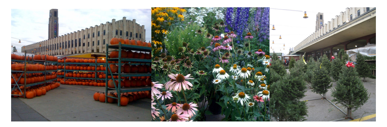
Fig. 9 Seasonal displays outside the Atwater Market.

created and enacted? And, if so, can it still function as a site for political activity and expression?