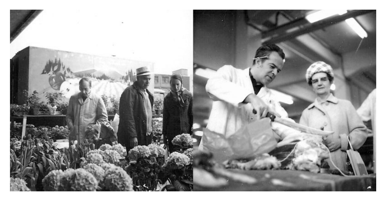
Fig. 3 Personnes regardant des fleurs, n.d. Gestion de documents et archives (VM94-U-641-19). Source: Héritage Montréal. Fig. 4 Un boucher et sa cliente, n.d. Gestion de documents et archives (VM94-U-641-16). Source: Héritage Montréal

Since its opening, the Atwater Market has primarily functioned in its important traditional purpose as a place where local residents could shop for food, but it can also be seen as a symbol and reflection of the particular values of the municipal government at the time it was built. Tangires points to the role of public market buildings as symbols of "government's commitment to a well-ordered public economy" and their role in managing problems associated with urban