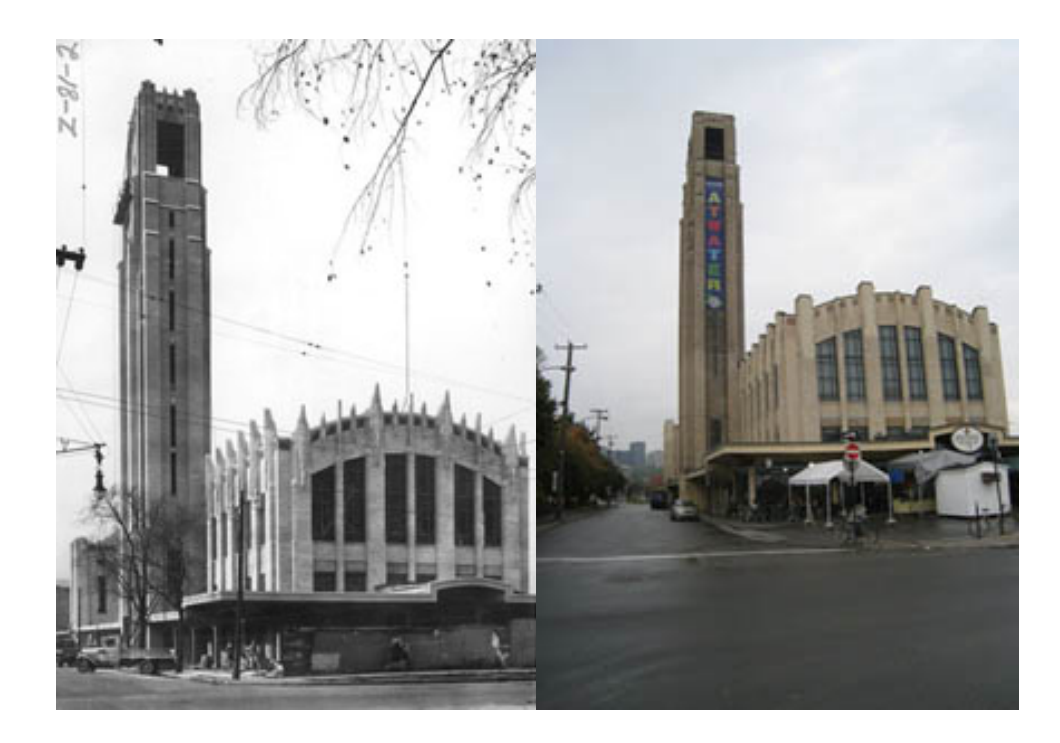
Fig. 1 Atwater Market, 1933. Gestion de documents et archives (VM94-Z-81-2). Source: Héritage Montréal. Fig. 2 Atwater Market. Photograph: Nicole Burisch, 2009.

applies these findings to the specific case of the Atwater Market. Thus, this paper represents a further attempt to gather and consolidate this existing information in order to develop a more indepth reading of this building through an art historical lens.