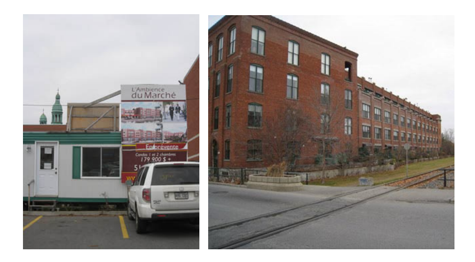
Fig. 7 (left) Condo Sales Centre outside the Super-C. Photograph: Nicole Burisch, 2009.

are to be. The Lachine Canal is undergoing change and sparking discovery and appreciation of the site among growing numbers of people. It has also spawned a form of development that is disturbing residents of the sector.