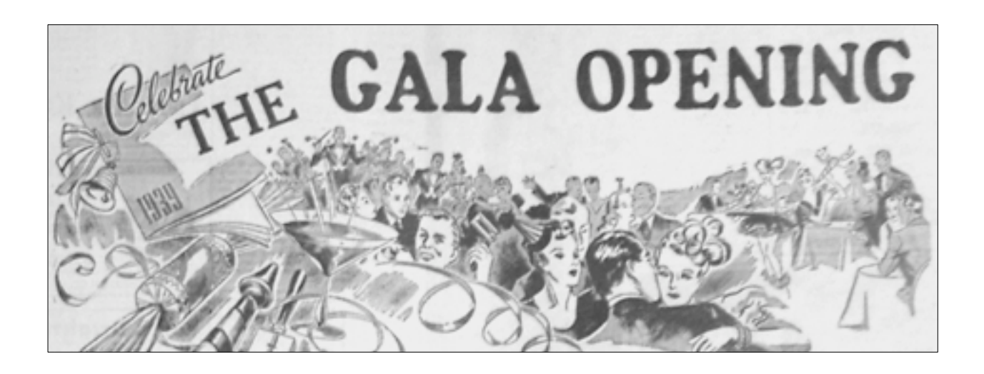
Fig. 3. The Guardian, 9 May 1941.