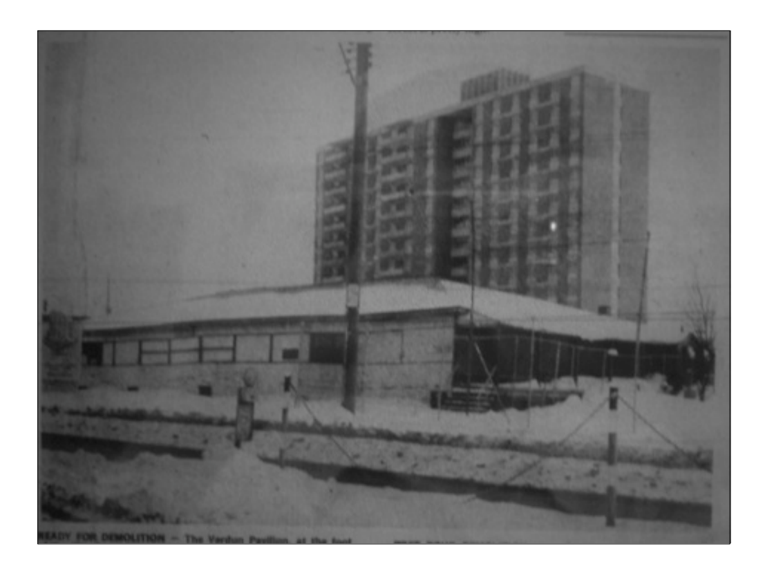
Fig. 1. The Verdun Dance Pavilion with newly constructed Senior Citizens' Home in the background. The Messenger 14 Jan. 1970.