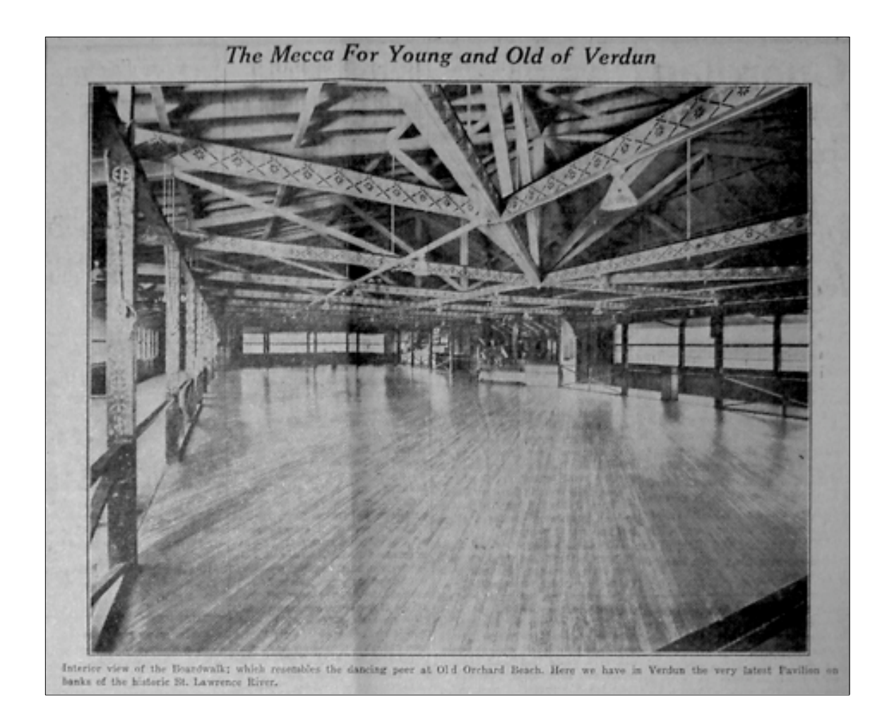
Fig. 2. Interior view of the Pavilion. The exposed beams were painted with a decorative pattern. The entrance facing LaSalle Boulevard can be seen to the right. Next to the entrance is what appears to be a ticket booth, while the space at the far right end of the dance floor may have housed the concessions stand. It is most likely that the bands performed on the dance floor itself. The shutters to the windows are all open. The Guardian , 18 June 1931.