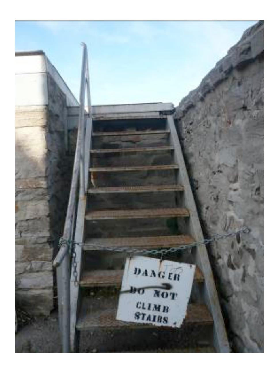
Fig. 7 Detail of stairs located next to garage, 2009.