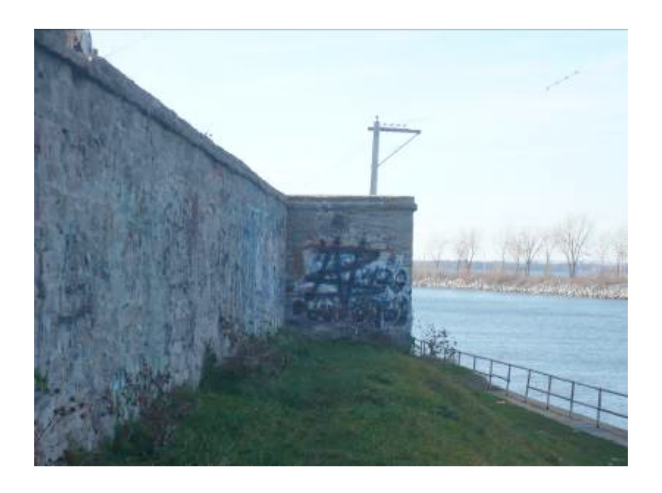
Fig. 5 Graffiti on the north wall of the Fort remnants, 2009.