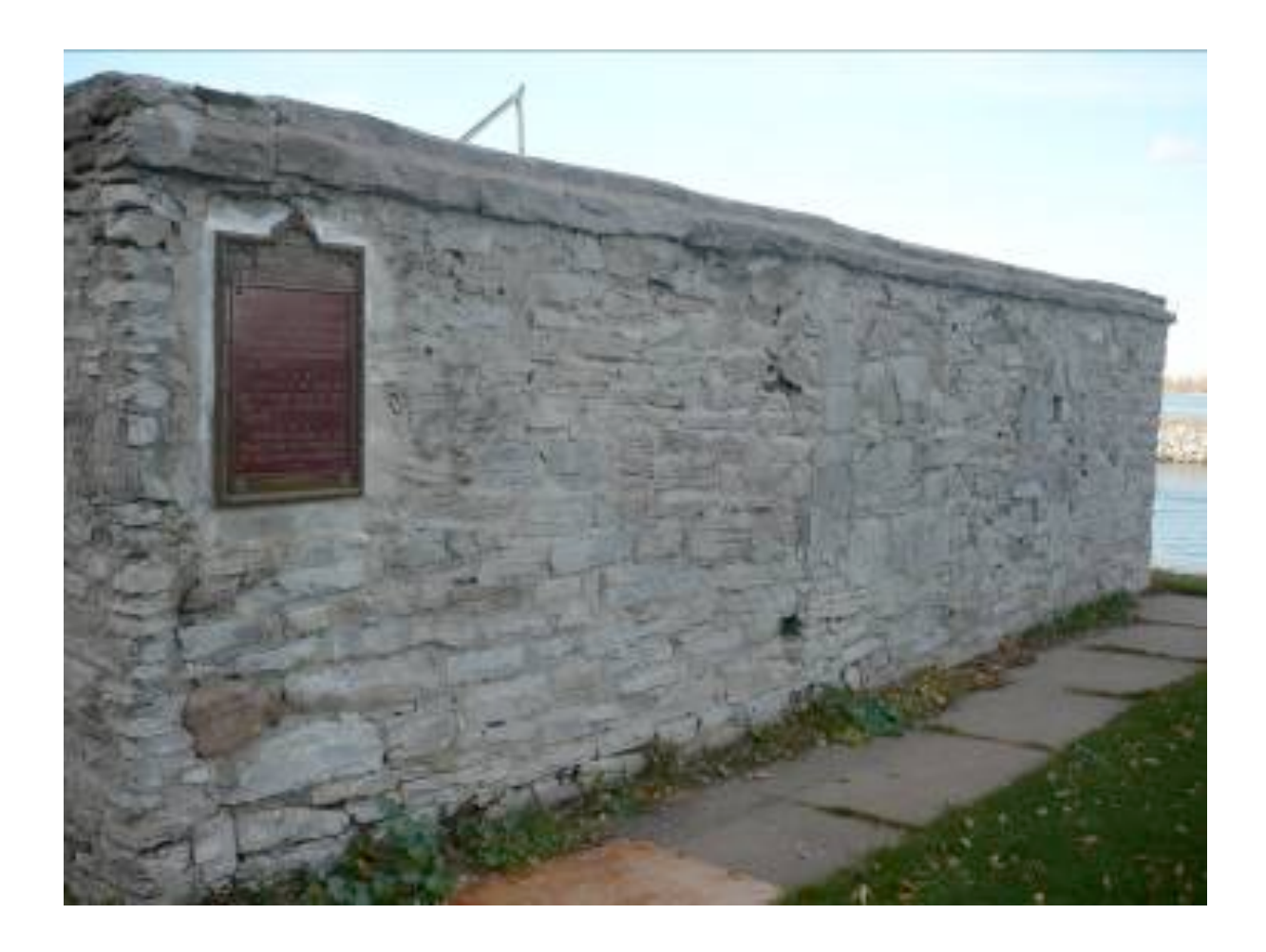
Fig. 1 A portion of the north wall of the Fort Saint Louis, Kahnawake, 2009, showing the bronze plaque denoting the wall as a historic site.