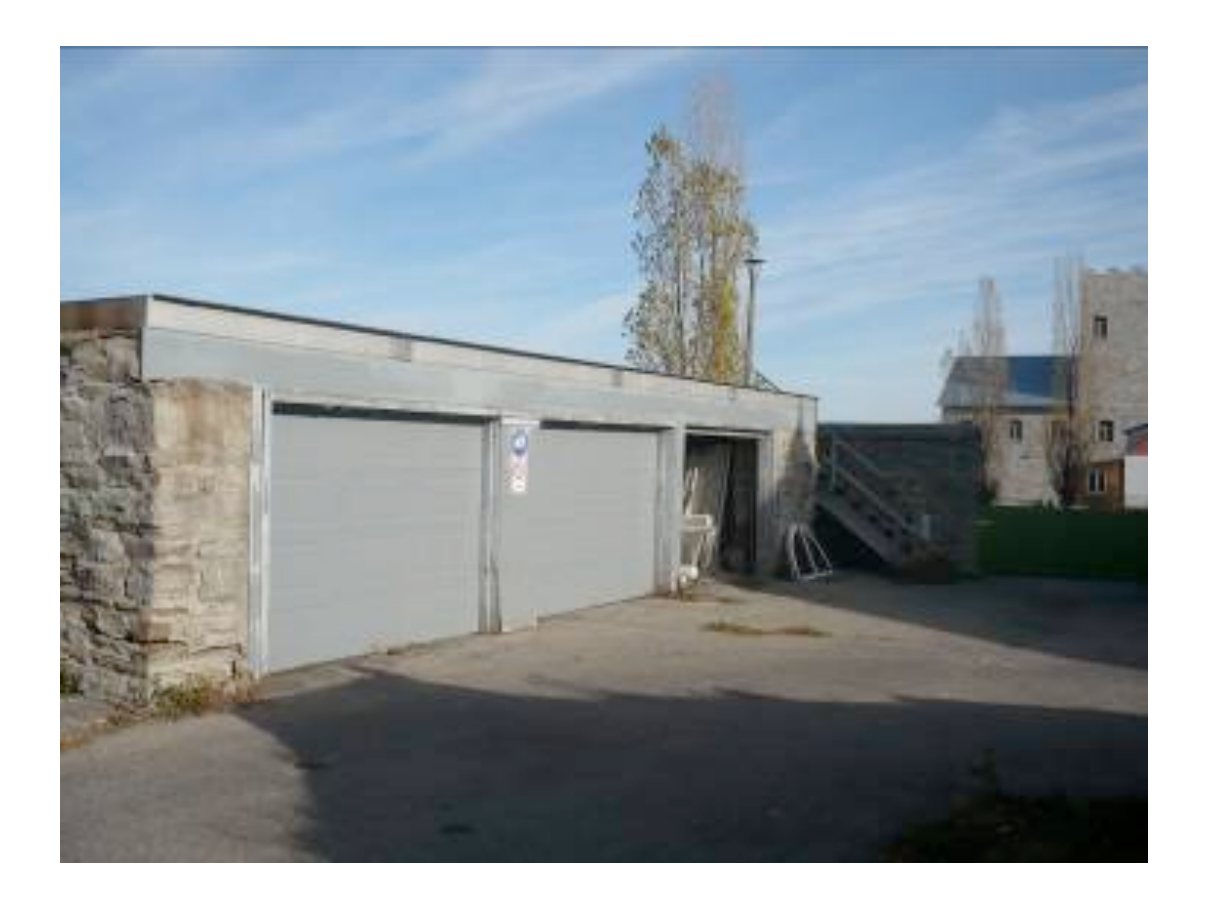
Fig. 6 Garage modifications and steel platform added to the wall circa 1970s, 2009. Digital photograph: Wahsontiio Cross.