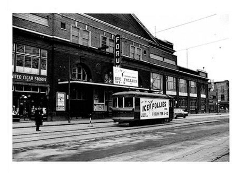
Fig. 4 Tramway 200, once located south of the Forum on St-Catherine Street (looking east). Photographer unknown, 1956. Courtesy of Les Archives de la STM, S6/11.1.2.

The following images are taken from two different eras of the site, taken in 1956 and 2009, respectively (Fig. 4 and 5). The later photograph of the Pepsi Forum illustrates that the building has basically the same exterior as the Forum after the renovations of 1968 (Fig. 2), except for the addition of trestles that are used to support advertising banners, signs and lights. Corporate logos, including Future Shop and AMC Cinemas, are now a highly visible aspect of the new development.