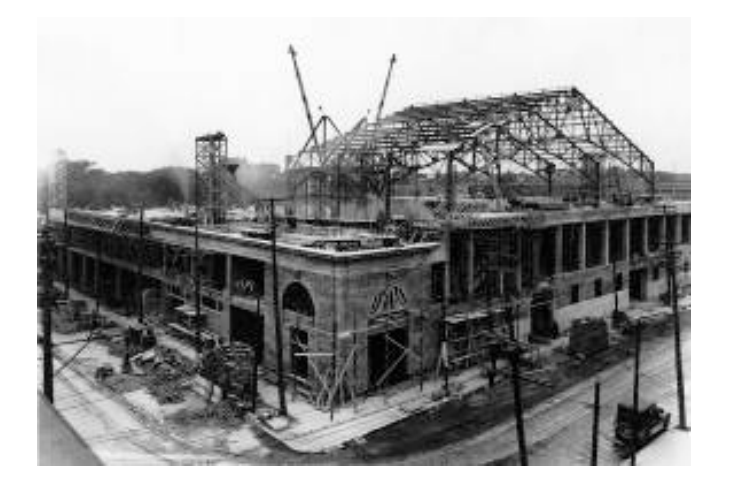
Fig. 1 The Forum, St. Catherine Street, Montreal, QC, 1924. Photographer unknown. Courtesy of the McCord Museum (Photo: MP-1977).

The next phase of the site began in 1924 when the Montreal Forum was purpose-built as a hockey arena (Fig. 1).