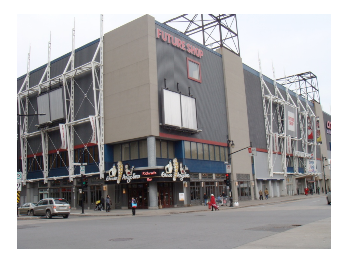
Fig. 5 Pepsi Forum exterior, Montreal, 2009.

It is inside the building that the developers attempted to commemorate the history of the site by creating a museum dedicated to the Forum. The showpiece of their attempt to salute the past is the re-creation of centre ice, featuring the Canadiens logo in the middle (Fig. 6).