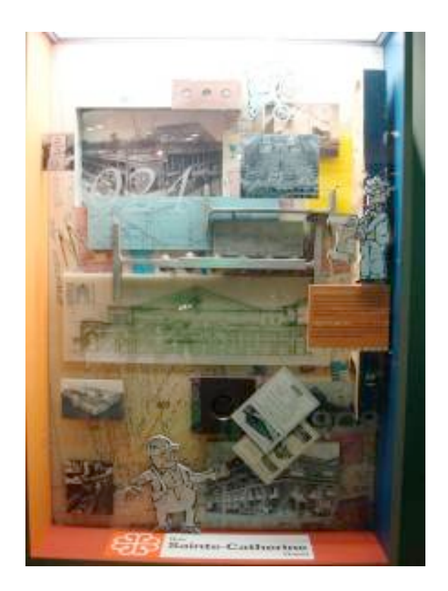
Fig. 8 Display case in the Forum Gallery, Pepsi Forum, Montreal, 2009. Concept, design and production by l'Atelier du Press-citron.

In contrast to these nostalgic gestures, the Forum Gallery on the second floor of the Pepsi Forum consists of a few small glass cases that document some of the important events in the history of the site. One of these cases visually depicts the many layers of architectural development during the history of the Forum (Fig. 8).