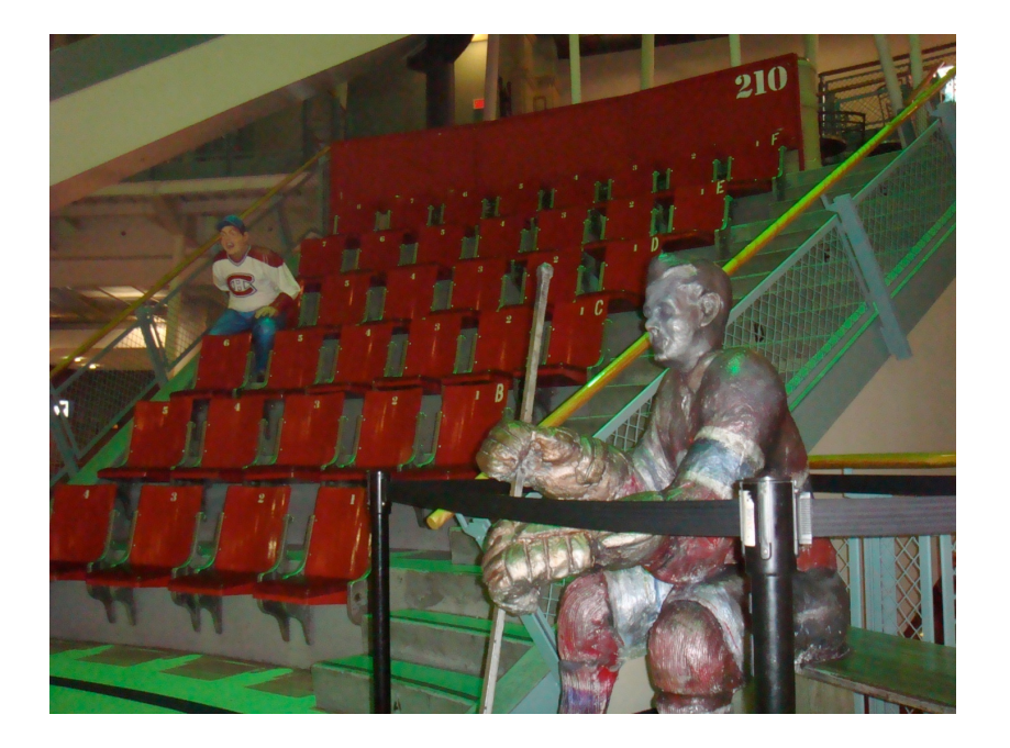
Fig. 7 Paule Marquis, Maurice "Rocket" Richard , cement and steel, 2001, Pepsi Forum, photographed in 2009. A bank of preserved Forum seats, section 210, can be seen to the left of the Richard monument.

Watching over centre ice is a cement and steel statue of Maurice Richard, an unattractive monument for one of the greatest Canadiens to have played at the Forum. Behind the statue, a bank of original Forum seats has been preserved along with the steep steps that once ushered spectators to their row. A statue of a cheering Canadiens fan watches an imaginary hockey game from the edge of his seat, perhaps attempting to recreate the emotional and tense atmosphere once characteristic of the stands (Fig. 7).