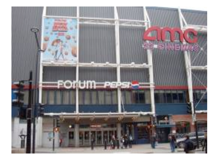
Fig. 3 Pepsi Forum façade, St-Catherine Street entrance, Montreal, 2009.

In considering the present and latest phase in the history of the Forum, my goal was to establish whether the Pepsi Forum has succeeded in commemorating the affect and heritage of this historically significant site. According to one of the people interviewed for this project, one