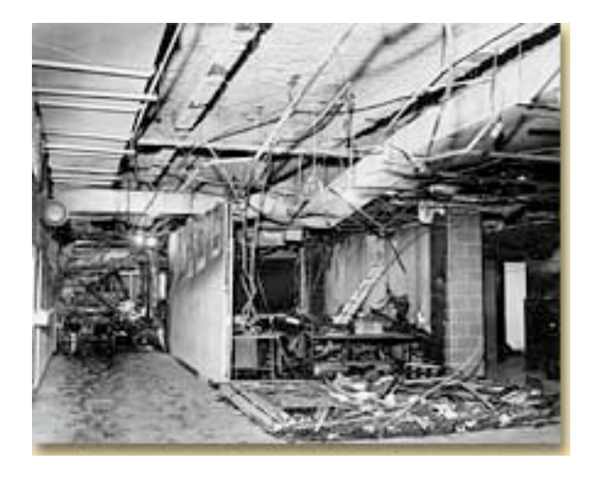
Fig. 6 Computer Riot fire damage, Ninth Floor, Hall Building, 1969. Courtesy of the Concordia University Archives. For research purposes only.