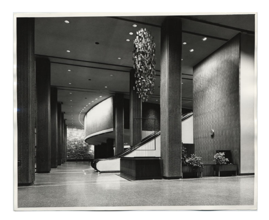
Fig. 4 Interior of the Hall Building, ground floor, showing escalator, 1965. Courtesy of the Concordia University Archives. For research purposes only.