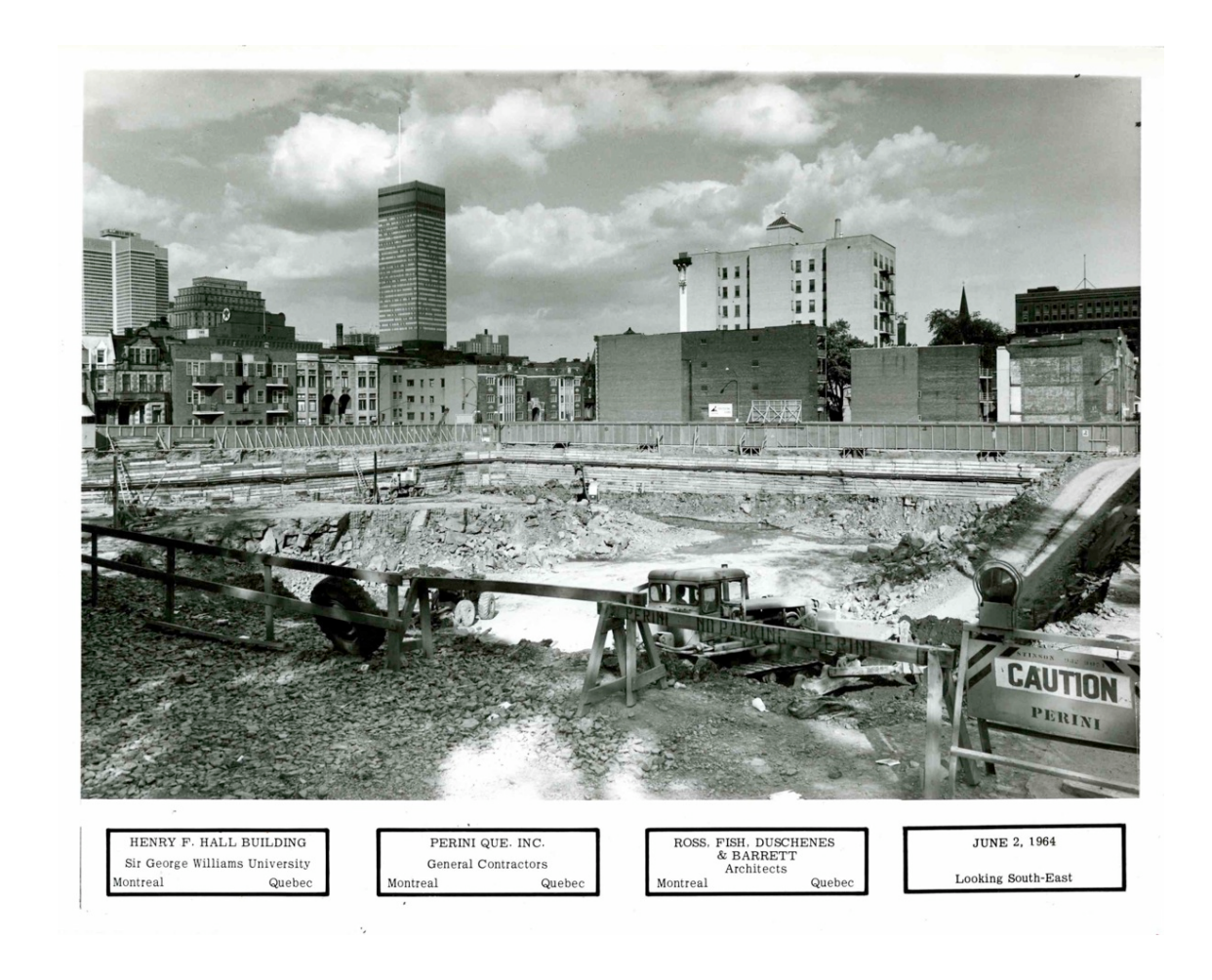
Fig. 1 Looking South-East at building site of the new Hall Building, 2 June 1964. For research purposes only.