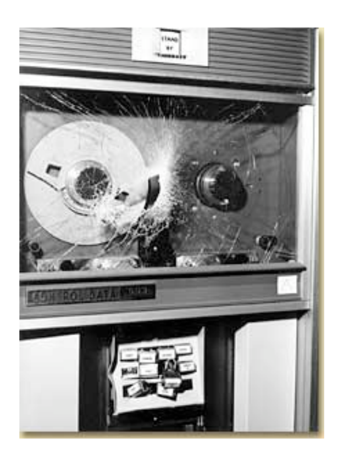
Fig. 5 Damaged computer bank, Ninth Floor, Hall Building, 1969. For research purposes only.