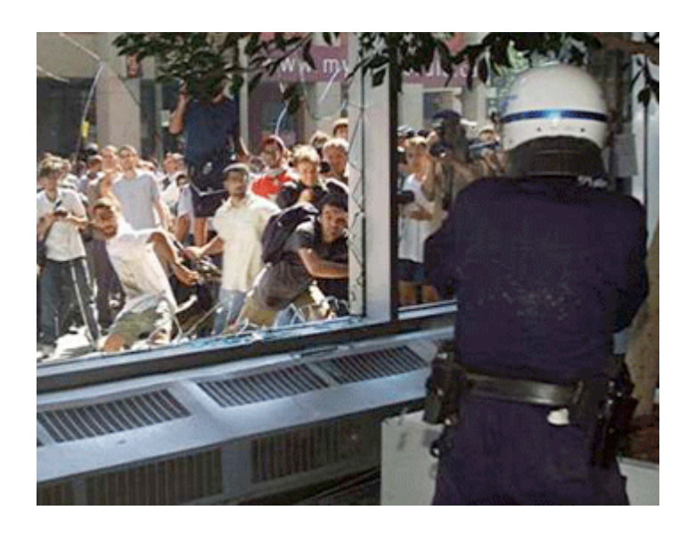
Fig. 7 Shattered ground-floor window, Hall Building, Netanyahu Riot, 9 Sept. 2002.