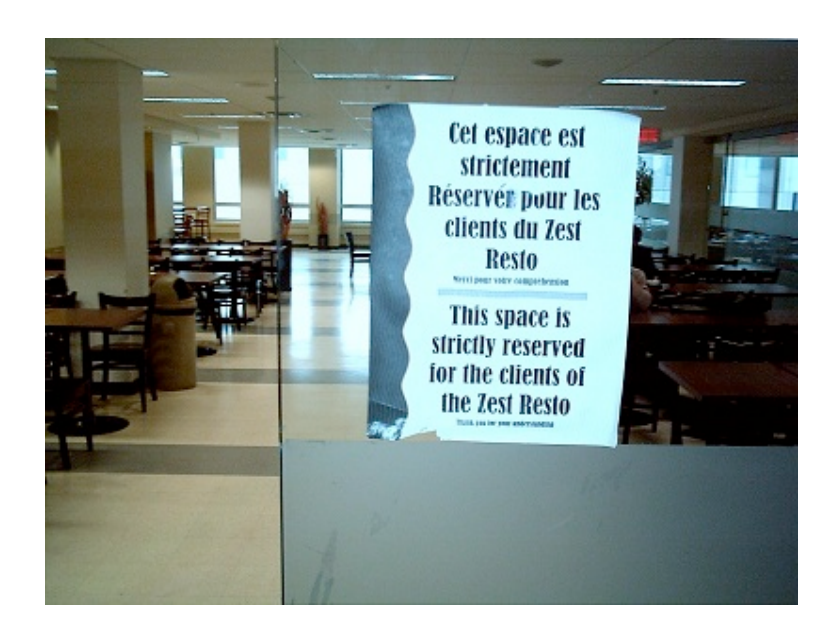
Fig. 10 Chartwell's vacant dining area, 7th floor, Hall Building, Concordia University. Photograph by the author, 2009.