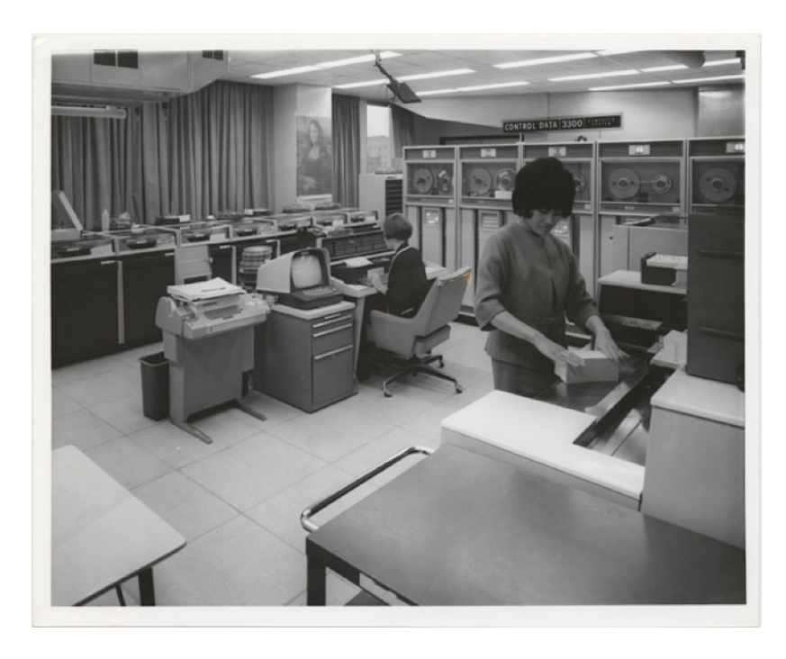
Fig. 3 The Ninth Floor Computer Centre, Hall Building, 1968. Courtesy of the Concordia University Archives. For research purposes only.