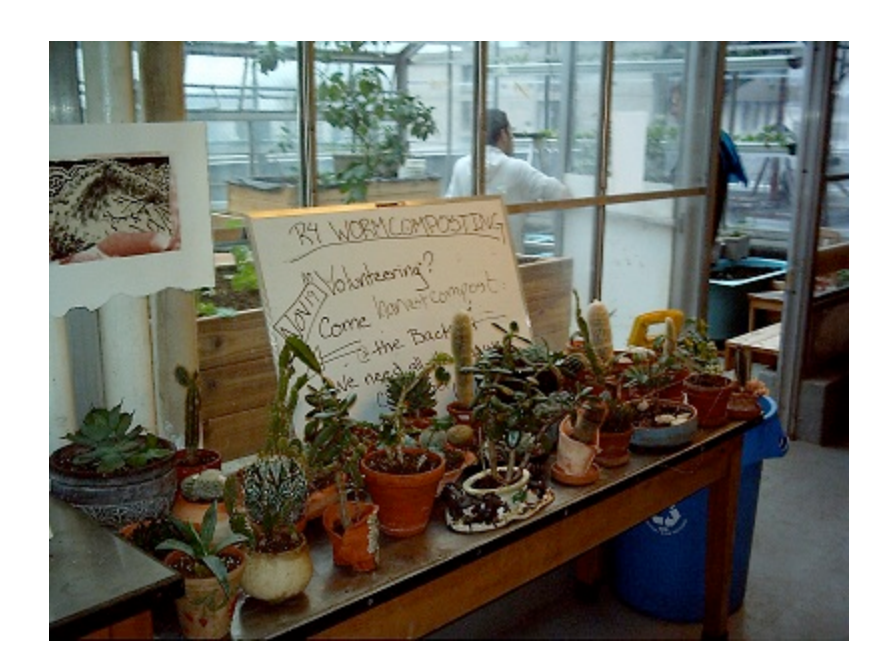
Fig. 12 Life in the thirteenth-floor greenhouse. Photograph by the author, 2009.