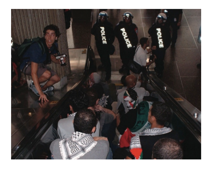
Fig. 8 Pro-Palestinian protesters stand off against riot police, 9 Sept. 2002.