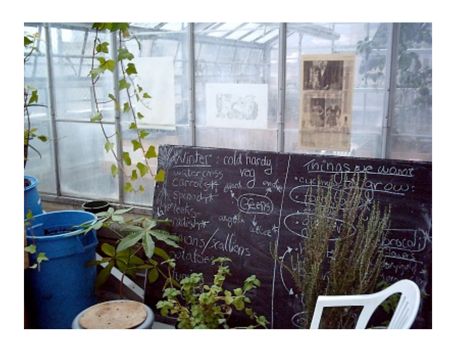
Fig. 11 The thirteenth-floor greenhouse: secret treasures in the Hall Building, Concordia University. Photograph by the author, 2009.